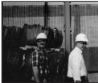
City Services Group at the Rumpke Recycling Center during Community Connections #12.

From October 18-November 8, 2000, ten Kharkivites representing a variety of public services for their city visited Cincinnati. Their professional programming included a trip to the coal-fired Zimmer power plant, a day at the Rumpke sanitary landfill, a visit to the composting site and a trip the city's recycling center. There were tours of public and private housing, and one day was devoted to the Metropolitan Sewer District's wastewater removal and treatment program that serves over 800,000 people. The group learned about billing procedures, meters, pipe and valve repairs, elevator repair, public-private cooperation and a host of other issues that have to do with the delivery of these public services.